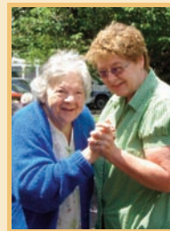
Dancing at one of the summer picnics.