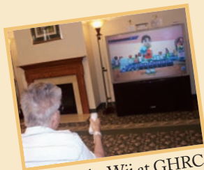
Playing the Wii at GHRC.