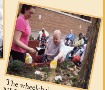
The wheelchair garden at NLHRC.