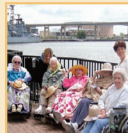
GHRC residents visit the Buffalo marina.