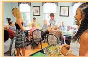
UB students help with bingo at Lutheran Church Home (LCH).