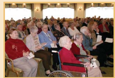
Residents, families, friends, and staff attended the 10-Year Anniversary Worship Service of Thanksgiving at GreenField Manor on Oct. 1.