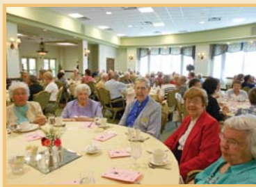
The Annual Volunteer Appreciation Luncheon was held in August.